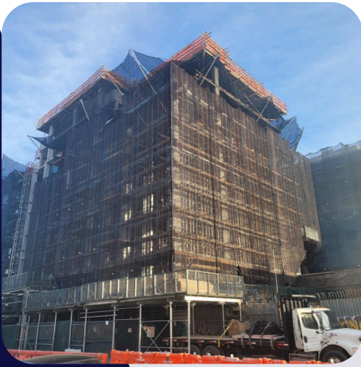
953 Dean Street SCOPE: Sidewalk Shed, Pipe Scaffolding, Hoists, Horizontal Netting, Roof Protection. New Construction by Twin Group Associates.

Here are three of our most recent projects, highlighting the type of work we deliver and the standards we bring to every job: