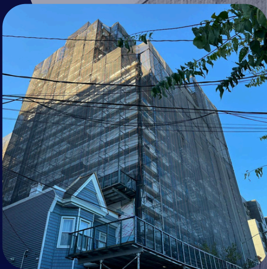
2407 Ryer Ave SCOPE: Sidewalk Shed, Pipe Scaffolding, Netting. New Construction by Blue Sky Builders.